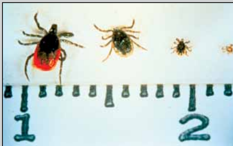
In this photo, the tick on the left is an adult female black-legged tick, which is red and dark brown. To her right is an adult male black-legged tick, which is smaller and dark in color. A nymph black-legged tick is the second from the right, and a black-legged tick larva is to the far right. (photo and caption from Minnesota Department of Health)

Fond du Lac is on the northern edge of the high-risk baagweziiga (deer tick) zone. Deer ticks are of special concern for the diseases they can spread: Lyme disease, human anaplasmosis, or babesiosis. Symptoms of Lyme disease include a bulls-eye skin rash (a red ring with a central clearing), fevers, chills, muscle and joint pain. The rash does not occur in all cases of Lyme disease and not every rash has a central clear area. The symptoms can occur within 3-30 days of receiving a tick bite.