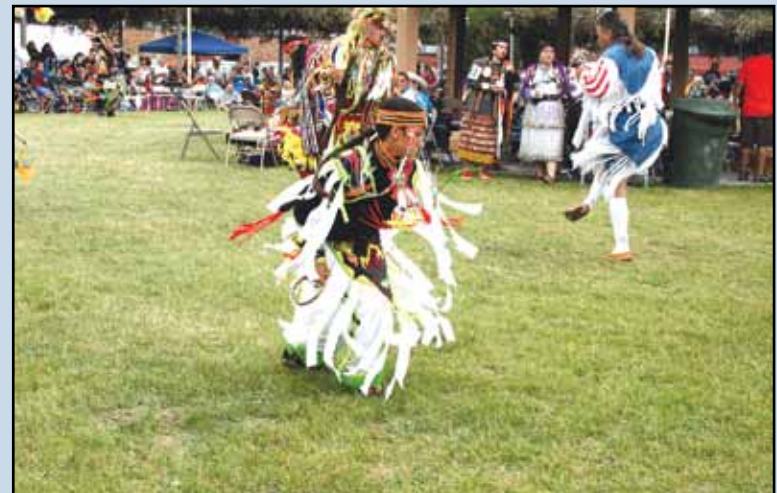
Dancing during the Veteran's Powwow.