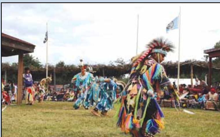
The crowd watches all the beautiful colors as the dancers perform.