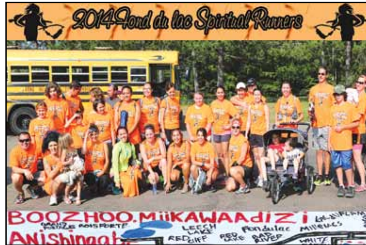
The FDL spiritual runners ran with the Matamua family from New Zealand and afterwards the kids made this banner.