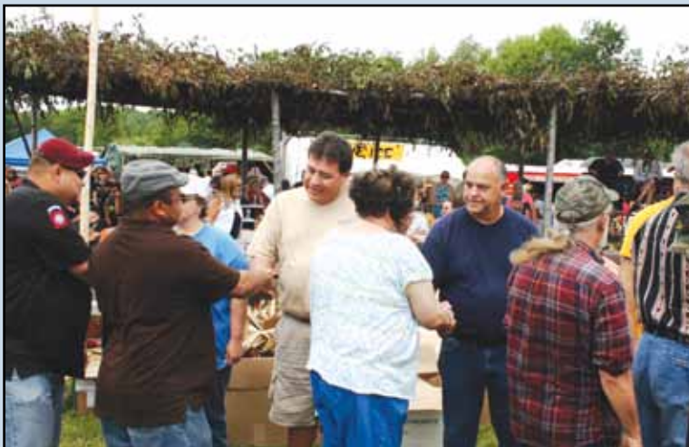
RBC members shaking hands with the veterans during the powwow.