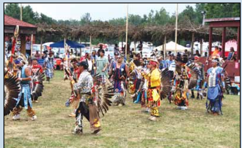
The Sobriety Powwow dancers following the flags during the Grand Entry.