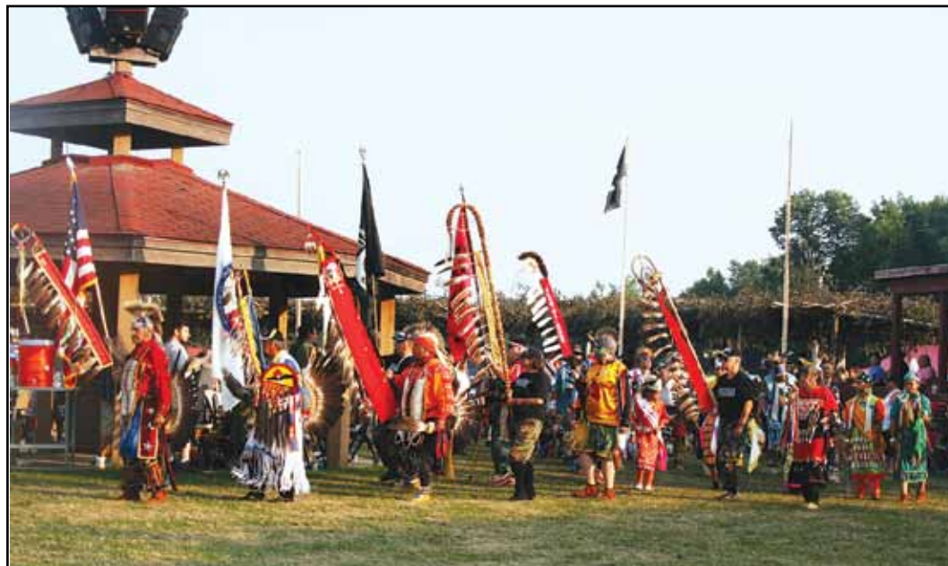
The flags during the Grand Entry.